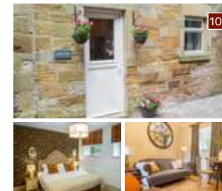
Gardeners' Rest North Yorkshire Moors

An extensively refurbished cosy self-catering, two bedroom, two bathroom country cottage, able to sleep up to four guests. Located on Grinkle Park Estate on the edge of the North Yorkshire Moors and only 10 minutes from Whitby.