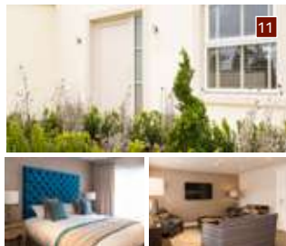
The Mews* Cumbria and the Lakes

The Mews are luxury self-catering one and two bedroom apartments providing the perfect 'socially distanced base' for guests. They are set in grounds of the Roundthorn Country House Hotel in the Eden Valley, just 5 minutes from Penrith.