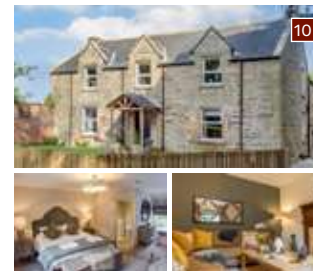
Low Moor House North Yorkshire Moors

An extensively refurbished self-catering country house with four beautiful bedrooms, able to sleep up to eight guests with separate lounge and family kitchen/diner. Located on Grinkle Park Estate on the edge of the North Yorkshire Moors and only 10 minutes from Whitby.