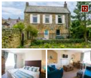
White Swan Cottage Northumberland

A three bedroom self-catering cottage in its own secluded grounds accessed by private entrance from Bondgate. Within in the heart of Alnwick. Where better to unwind and relax than this popular Northumberland town famous for its castle and gardens.