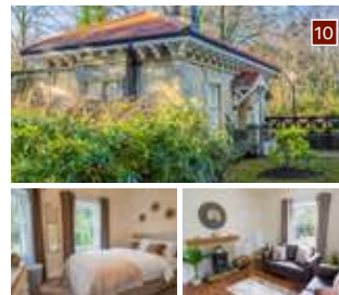
Gatekeepers Cottage North Yorkshire Moors

A two bedroom self-catering country lodge on Grinkle Park Estate set within 300 acres of grounds. Located on the edge of the North Yorkshire Moors and only 10 minutes from Whitby. The ideal starting point to find out what this beautiful coastline and countryside has to offer.