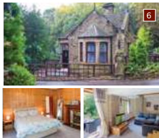
Highwood Lodge West Yorkshire

A four bedroom self-catering country lodge on Bagden Hall Estate set within 30 acres of grounds. Located in 'Last of the Summer Wine' countryside Yorkshire Dales there's no better place to explore with your family.