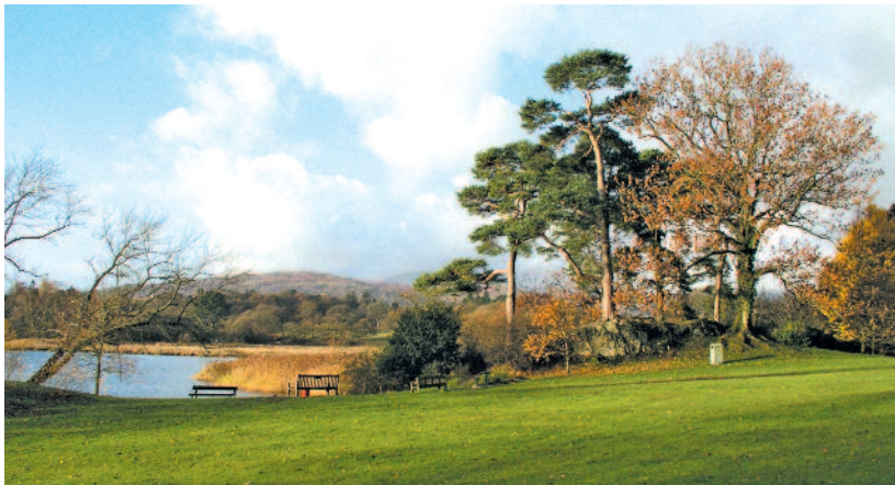
Borrans Park - P. Southall