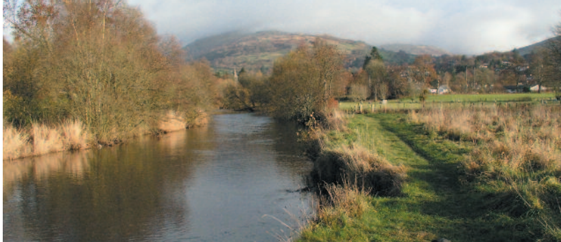
River Rothay - P. Southall

Council and, although it is only for a short distance, it is delightful to walk by the small sandy beaches, reed beds and picnic sites. Walk around but before the path leaves the park, cut across the grass to the gate and enter Galava, Ambleside Roman Fort - see page 37.